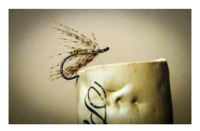
Partridge and olive quill soft hackle fly

Earlier this year, we published a blog post titled Classic Flies are Classic for a Reason . The gist of that post was that the patterns that have stood the test of time have done so for a reason and given such should likely have a place in your fly box. Soft hackle flies are one of those classics. I have met many fly fishermen for which they are an absolute staple, employed on the stream as often as a pheasant tail nymph or Parachute Adams. But I've met many more that don't fish them at all or only rarely do so, considering them sort of an oddity.