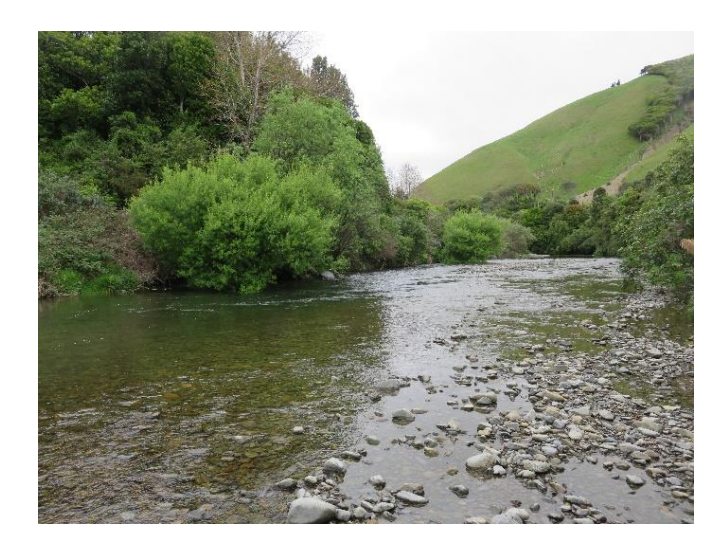
For those of us who fish, the river is a refuge

At some point, all of us have to make a strategic retreat. We can't just keep pressing forward all the time. It's not practical.