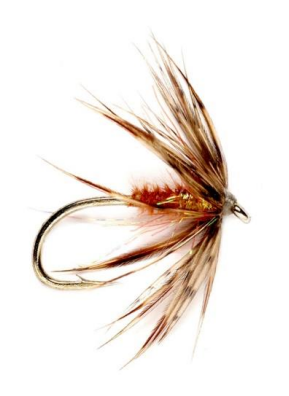
The Sparkle Soft Hackle Fly

Earlier this year, we published a blog post titled Classic Flies are Classic for a Reason . The gist of that post was that the patterns that have stood the test of time have done so for a reason and given such should likely have a place in your fly box. Soft hackle flies are one of those classics. I have met many fly fishermen for which they are an absolute staple, employed on the stream as often as a pheasant tail nymph or Parachute Adams. But I've met many more that don't fish them at all or only rarely do so, considering them sort of an oddity.