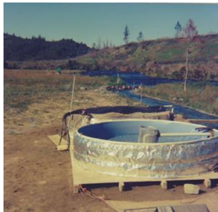
Barker's salmon culture venture was started in Takaka with two paddling pools

One of the advantages of rainbow trout over salmon is they do not die of maturity like Pacific salmon do. Hatchery systems have produced trout for food and sports use for 279 years and other countries are still doing so. Why in New Zealand is only half the potential of trout utilised.