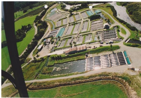
Clive Barker's salmon farm in Takaka, Golden Bay

Their argument that they have a totally wild river trout fishery seems a stretch.