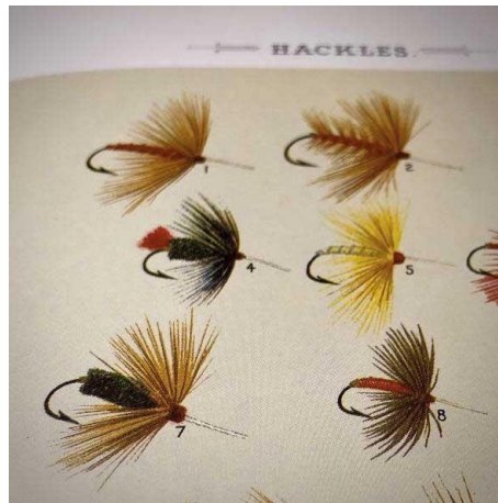
Plate from Mary Orvis Marbury's "Favourite Flies and Their Histories" (1892)

In 1883 Mary Orvis Marbury of Vermont penned: "The Cock-y-Bonddu Hackle is made in imitation of a small beetle, sometimes called the Bracken Clock. There are several species, some of them found upon poplar trees, and others are numerous upon ferns by the waterside. Fly makers vary the size of the fly and its colour slightly, and name it according to locality, as the Marlow Buzz, Shorn Fly, Hazel Fly and Brown Beetle.